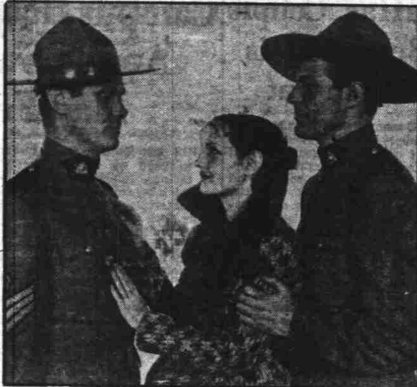
Paul Kelly, Rochelle Hudson and Robert Kent are featured in the adventurous story of the north, "The Country Beyond", current Grand attraction.