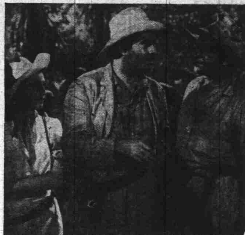
Three great stars, Barbara Stanwyck, John Boles and Wallace Beery face adventure and danger in "A Message to Garcia" at the Elsinore today.