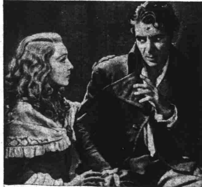
Isabell Jewell is given courage to face the guillotine in "A Tale of Two Cities" by her fellow prisoner, Ronald Colman who has the role of Sidney Carton. The film is showing today at the Hollywood.