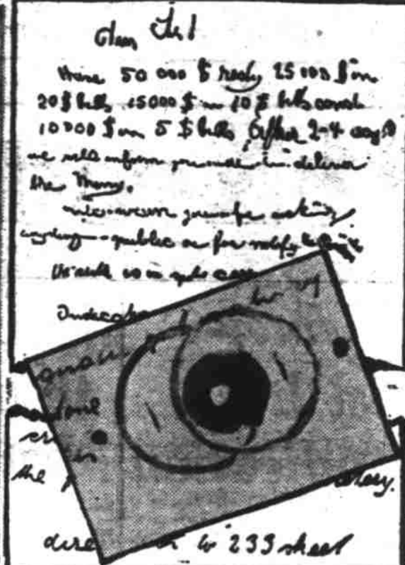
On the window sill Col. Lindbergh discovered the first ransom note with its mysterious symbols.