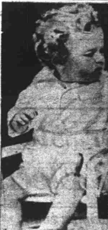
The kidnaping of Charles Augustus Lindbergh, Jr., on the night of March 1, 1932, shocked the world.