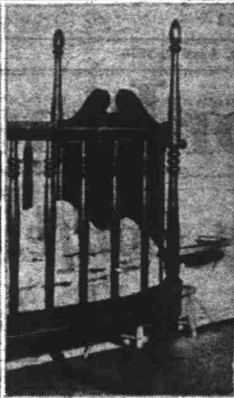
The empty crib showed the stealthy intruder had slipped the child out without unpinning cover guards.