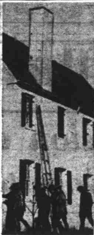
A ladder was used by the kidnaper to enter the baby's nursery.