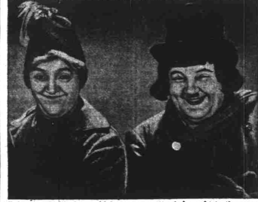
Bohemian Girl", the world famous operetta, is brought to the screen of the Capitol theatre today with Laurel and Hardy in the starring comedy roles.