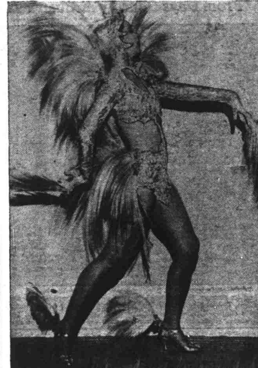
Jessie Matthews is more fascinating than ever in "First A Girl" at the State theatre today.