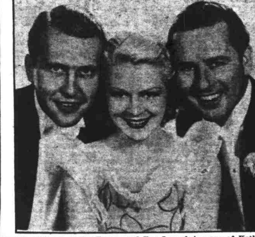
Ralph Bellamy, Claire Trevor and Ben Lyon bring one of Kathleen Norris' best-loved novels to the screen of the Grand today in "Navy Wife." It is from the book, "Beauty's Daughter."