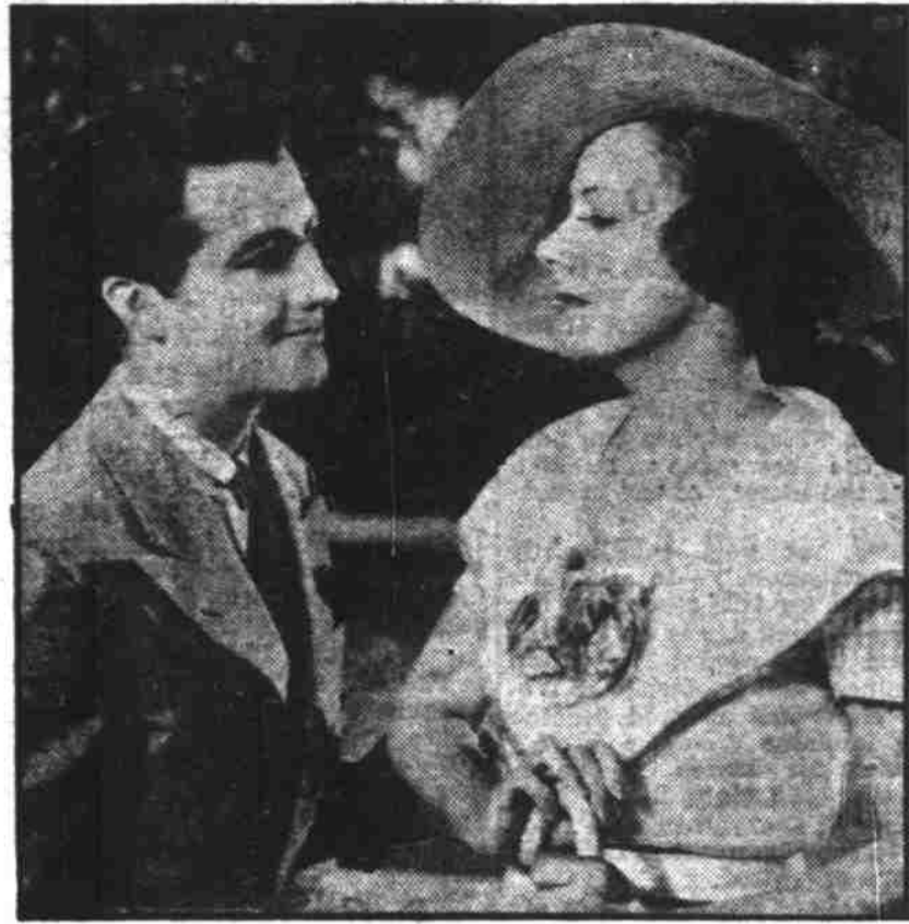
Robert Taylor and Irene Dunne portray the leading roles in "Magnificent Obsession," current Elsinore attraction.