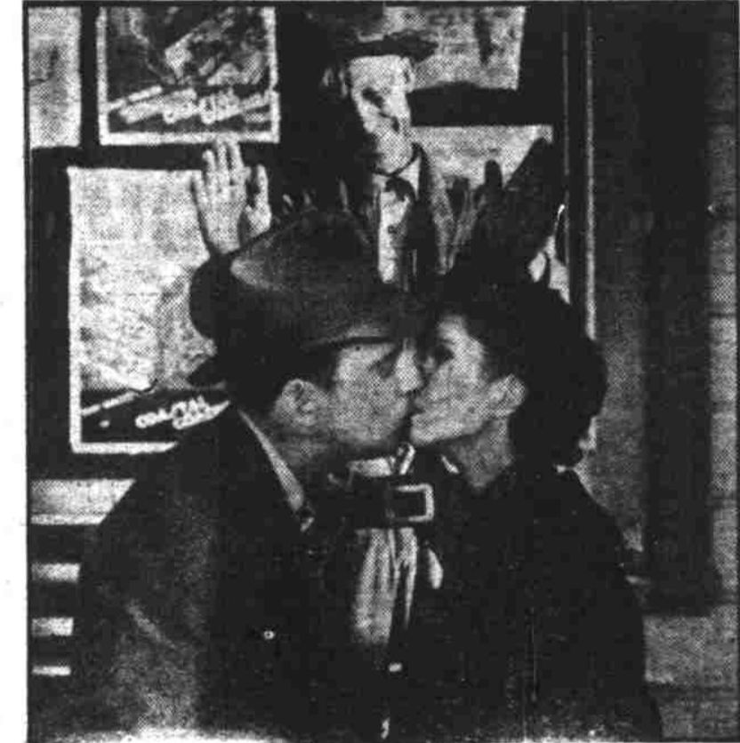
William Gargan and his country sweetheart, Marguerite Churchill, outsmart the big city gangsters in "Man Hunt," Capitol feature today.