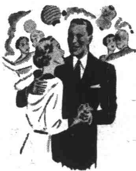
See Arrow white shirts — true triumphs in the shirtmaker's art.