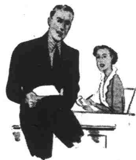
See Arosset — the starchless Arrow Collar that looks immaculate all day.