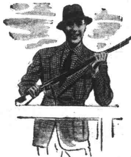
See how smartly Arrow styles its sports and country shirts.