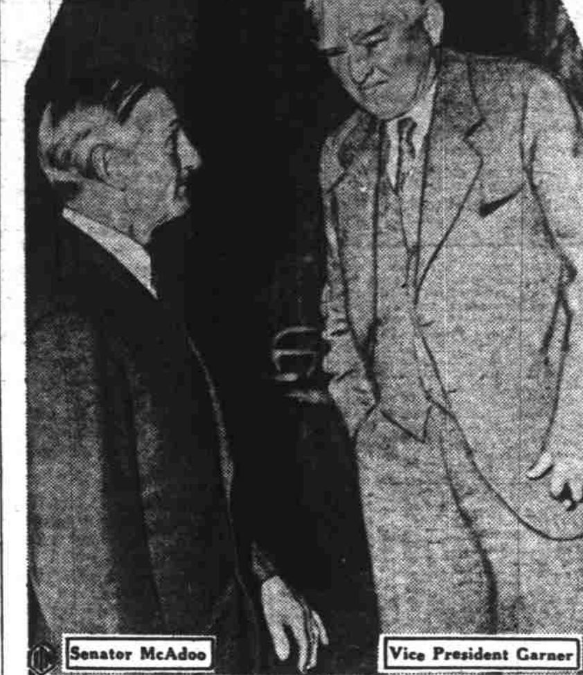
Philadelphia was selected as the site of the national Democratic convention in June when party chieftains met in caucus at Washington where veterans William Gibbs McAdoo, senator from California, and John N. Garner, vice president, were snapped at a conference of their own during a lull in the main business session.