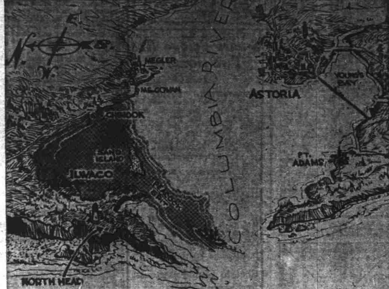
The deaths of 84 men in the wreck of the freighter Iowa on Peacock Spit at the mouth of the Columbia river emphasizes anew the hazards of that gate way to the Pacific ocean, Drawing shows the mouth