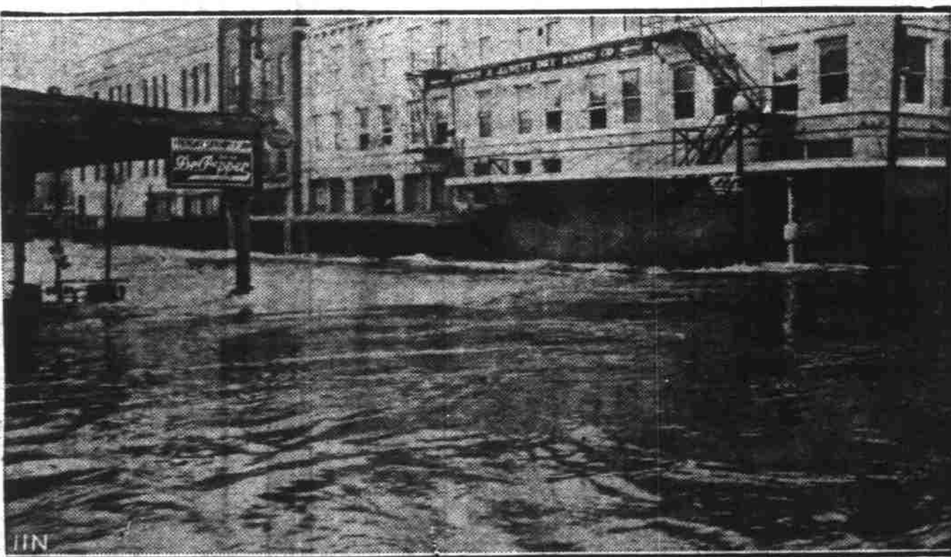
This graphic photo shows flood waters tearing down | uting to the heavy toll taken by a flood which cost six lives and caused $2,000,000 property damage. one of the main streets of Houston, Tex., contrib-

Cards in this directory run on a monthly basis only. Rate: