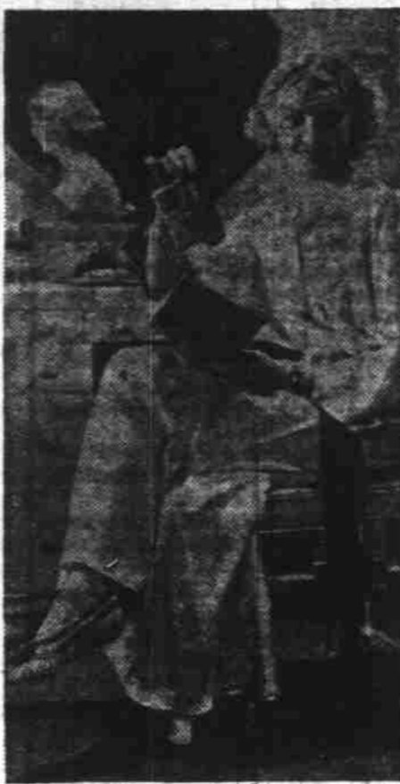
June Knight, attractive blonde screen actress, displays the latest in boudoir attire. Her brocaded satin negligee has a long fringe of each of contrasting color. To complete the ensemble she wears knitted slippers of harmonizing pastel colors.