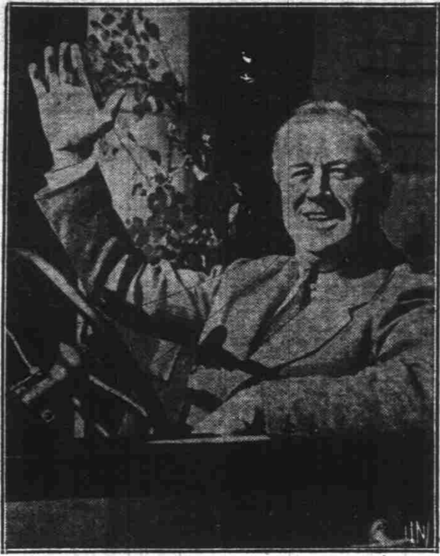
President Roosevelt is shown smiling at wheel of specially constructed car which he drives around Warm Springs, Ga., during his vacation there.