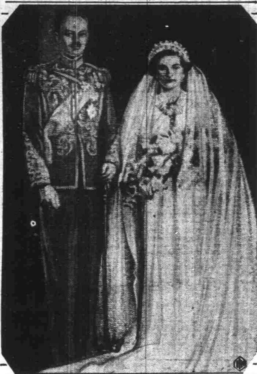
Prince Henry and bride. Here is a radiophone of Prince Henry, Duke of Gloucester and third son of King George and Queen Mary, as he left the private chapel at Buckingham palace with his bride, the former Lady Alice Montagu-Douglas-Scott, a few moments after their marriage.