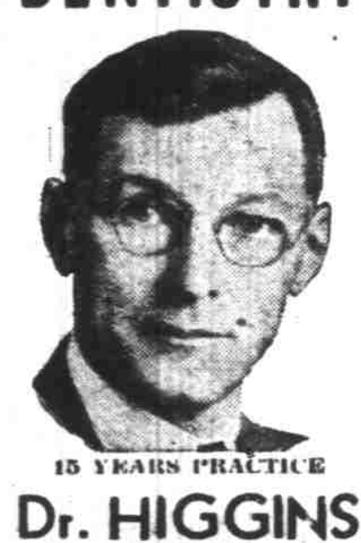
DENTIST Over J. C. Penney Store Telephone 6834

CHOICE BEEF ROASTS, lb. . . 10c STEAKS, tender, lb. . . . . . 15c Rib or Sirloin MUTTON ROASTS, lb. . . . . 8½c MUTTON CHOPS, lb. . . . . . 11c LIVER, lb. . . . . . . . . . . 15c SHORTENING, lb. . . . . . . 10c DILL PICKLES, qt. . . . . . . 5e MINCE MEAT, lb. 10c; 2 lbs. 19c