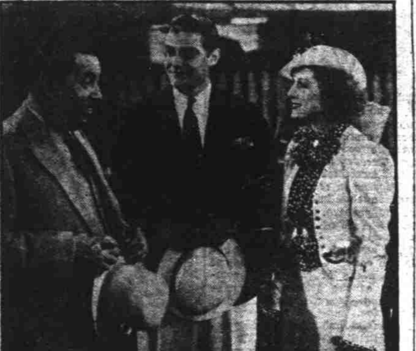
Warner Oland gives another fine characterization of the famous Chinese detective in "Charlie Chan in Shanghai" at the Grand today.