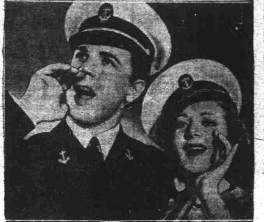
Dick Powell and Ruby Keeler are romancing again in "Shipmates Forever" at the Elsinore today.