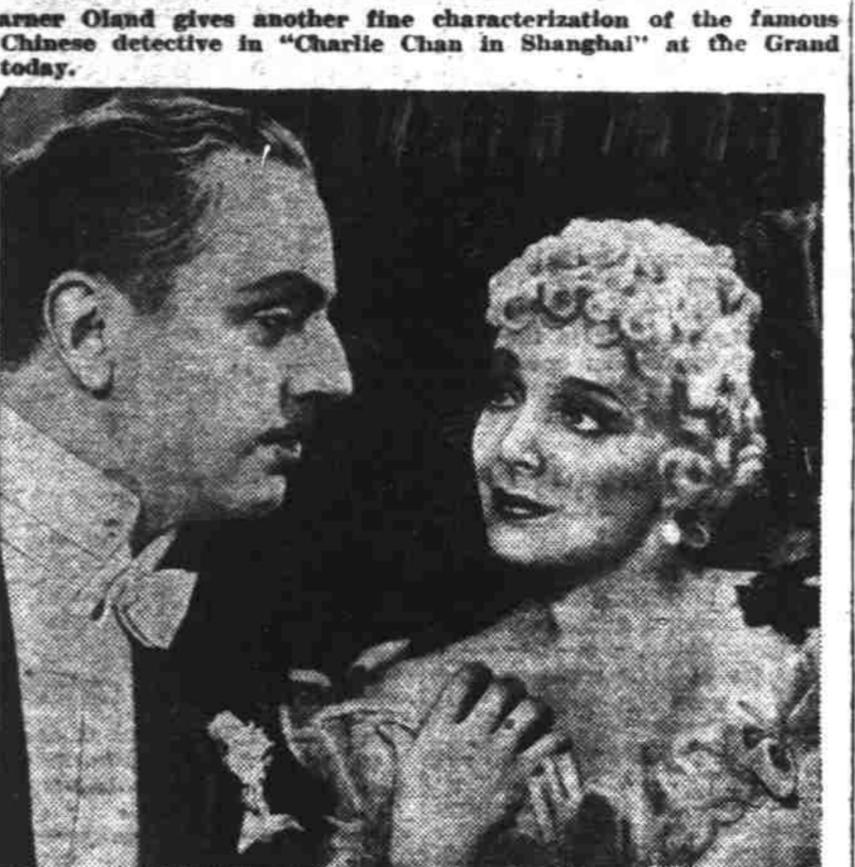
William Powell and Virginia Bruce have leading roles in "Escapade," current attraction at the Hollywood.