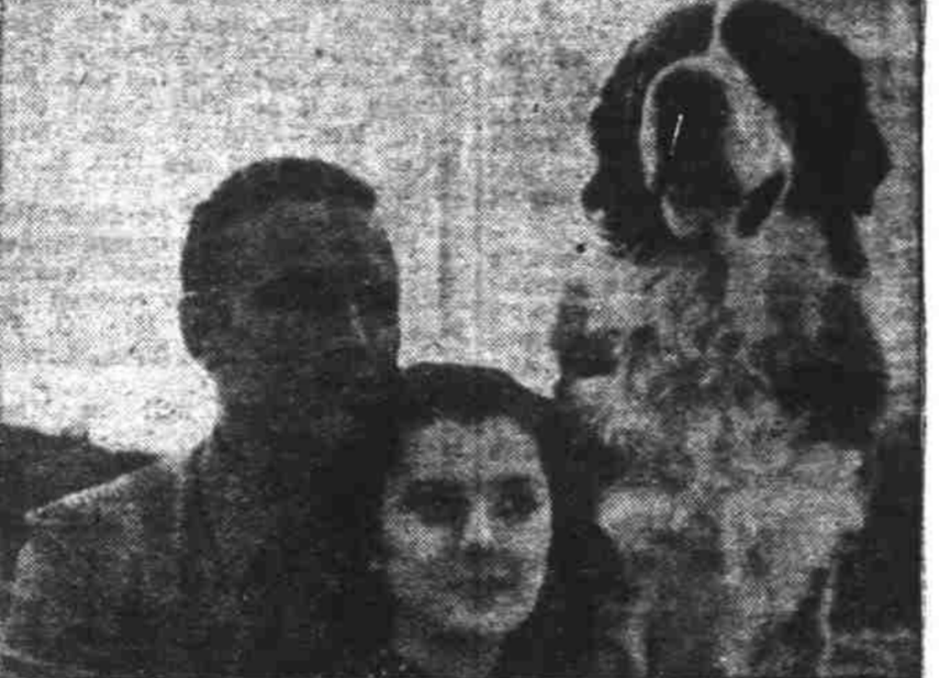
Gene Autry, radio cowboy singer, has the lead in "Melody Trail," one of the features at the Capitol today.