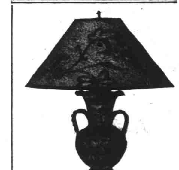
Table Lamps New Today!

Miller's are Salem's exclusive agents for Enna Jettick footwear for women. Footwear that combines a smart fashion with comfort. Enna Jetticks are thoroughly tailored to fit the foot... just try on a pair and feel the difference! The new dressy ties as well as straps are here now priced at only $5 and $6.