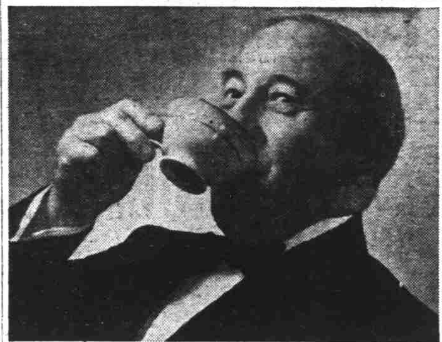
He used to complain about his coffee!

PORTLAND, Ore., Oct. 17.—(AP)—Roosevelt high school and the Benson polytechnic football teams battled through their game here last night to a 13 to 13 tie.