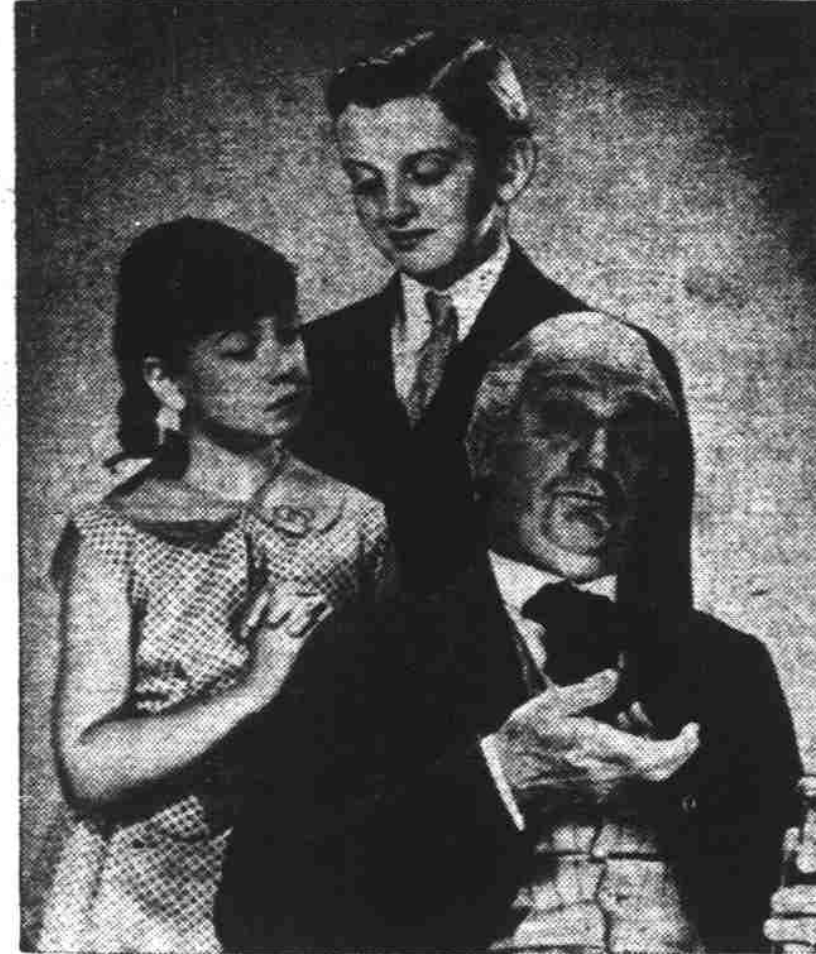
Jane Withers and Jackie Searl make things tough for O. P. Heggie in "Ginger" at the Hollywood today.