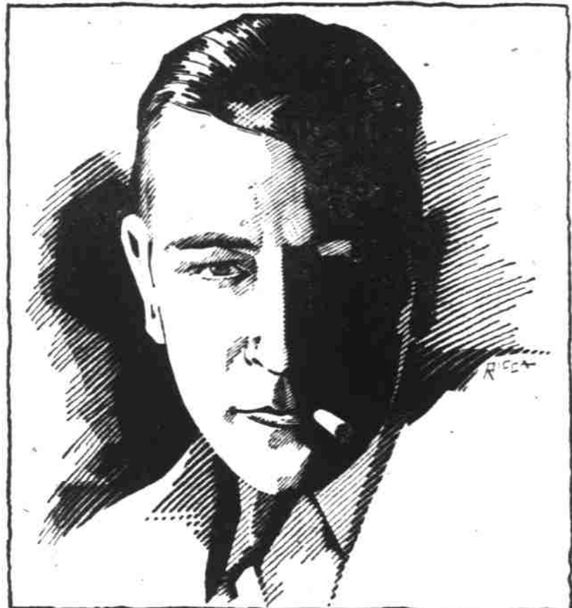
"The Thin Man's Hard-Boiled Brother"—George Raft in another role like "Scarface" in a strong Dashiell Hammett story, "The Glass Key," will be the attraction at the State theatre today.