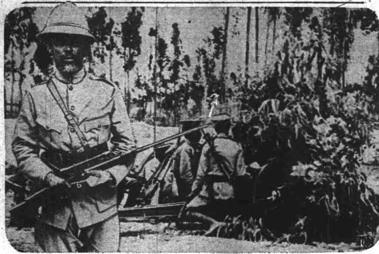
Here are Ethiopian artillerymen practicing the art of camouflage as taught by Belgian officers. Inset is a photo of the governor of one of the Ethiopian provinces with a sharpshooting rifle.