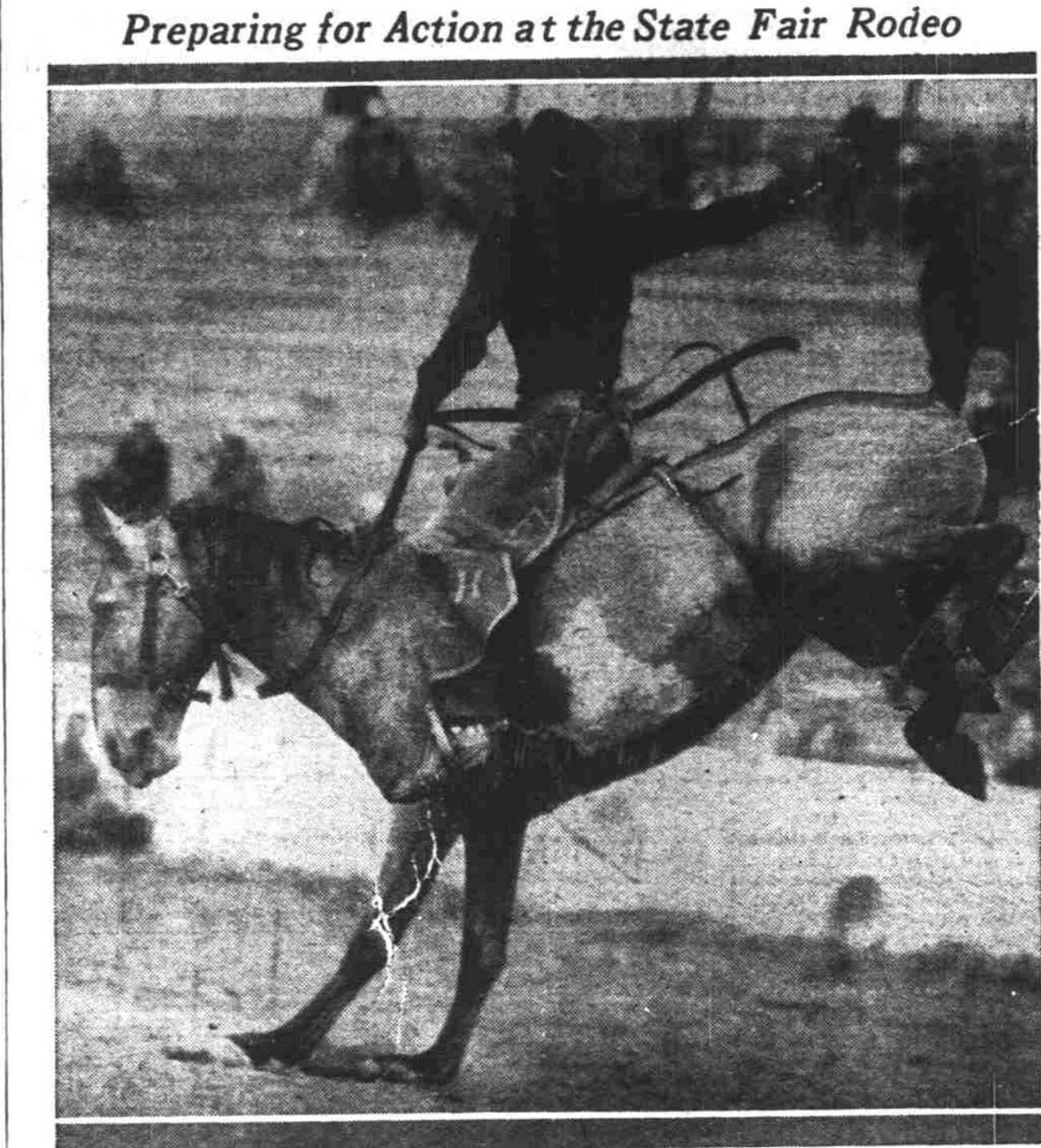
Boy rico of Ventura, Calif., champion bronco rider and winner of the calf roping contest at Molalla this year, is one of the famous "cow-pokes" who will be seen in action at the Oregon state fair night rodeo, starting Monday night, September 2, immediately following the horse show. A carload of wild horses is being brought here for the show.