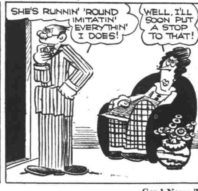
Good News Travels Fast!