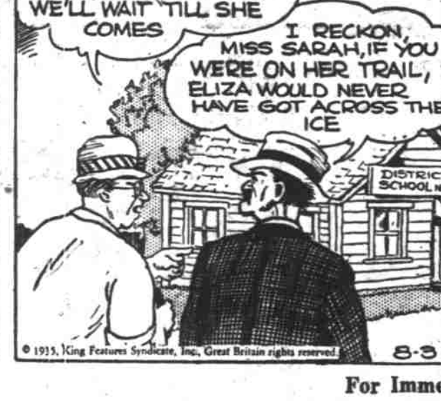
For Immediate Action THEY HAVEN'T SEEN EACH