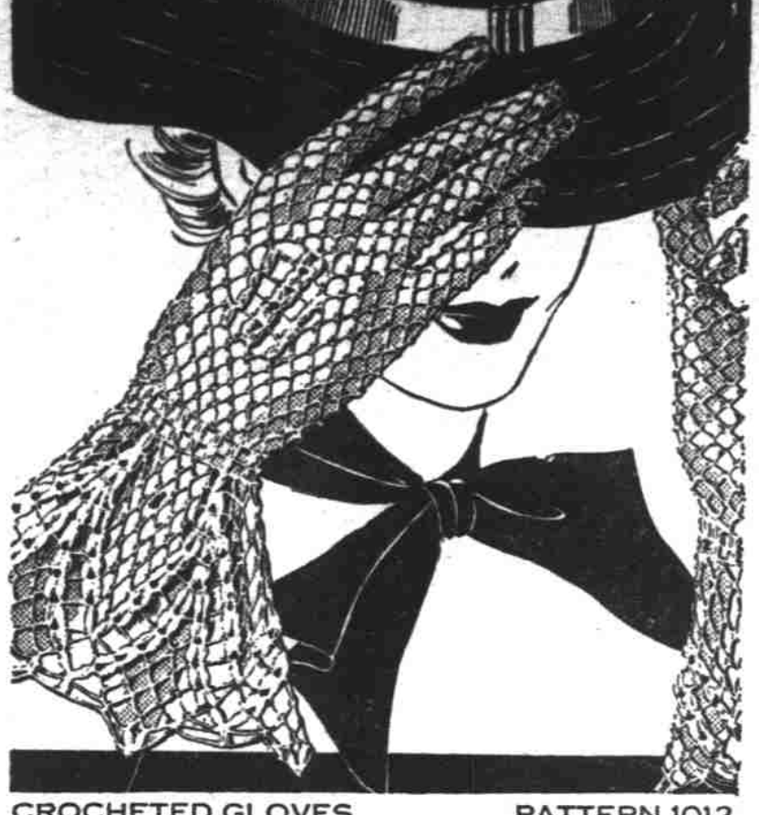
CROCHETED GLOVES PATTERN 1012

Here is the height in summer comfort and beauty of needlework—gloves that are indeed as airy and dainty as a cobweb. You'll be the envy of all your friends when you wear these! The mesh is a large one—that's what makes them cool and dainty at the same time. But, best of all, it makes the work go faster. The dainty cuff with its design in puff stitch will add to the beauty of your summer wardrobe. Pattern 1012 comes to you with detailed directions for making the gloves shown in a small, medium and large size, all given in one pattern; illustrations of it and of all stitches used; material requirements.