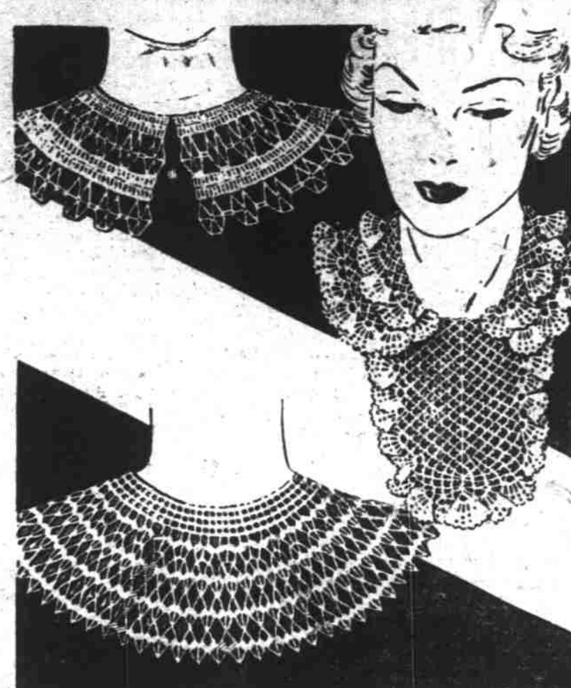
CROCHETED COLLARS PATTERN 1018

Every woman today knows what a transformation a dainty crocheted collar can make in her appearance — the simplest dress takes on personality. With a choice of three such lovely collars that are so different, you'll find yourself able to change the appearance of that dress completely each time. Besides that, each collar will be a fascinating bit of needlework to you. The top one is very effective in petit boucle, string or linen floss. The other two are made of a finer cotton. In the one with frilled ruffles, the collar is one straight piece with rounded ends, the same design being repeated in the jabot. You start at the center of the strip and work round and round and then put on the fringe. The third one is the last word in lacy and can be worn opening in front or in back—as you choose. It's a very simple one to crochet.