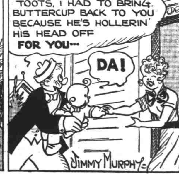
Buttercup Gets His Way