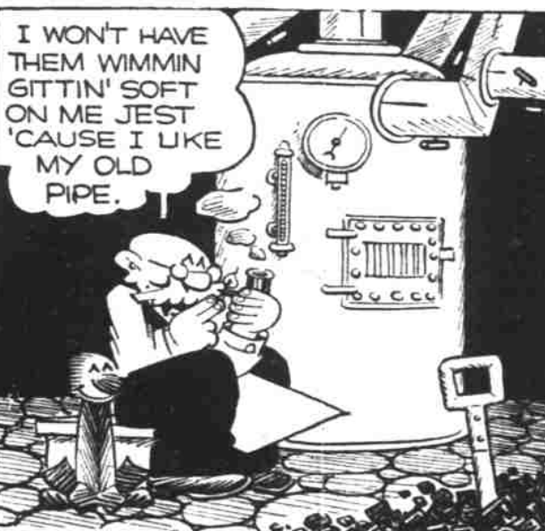
A Feller Can't Be Too Careful