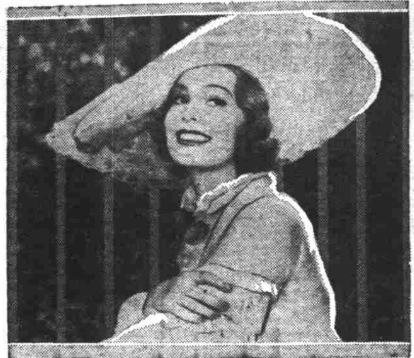
Valerie Hobson is married to a mad scientist in "Werewolf of London" current attraction at the Elsinore.