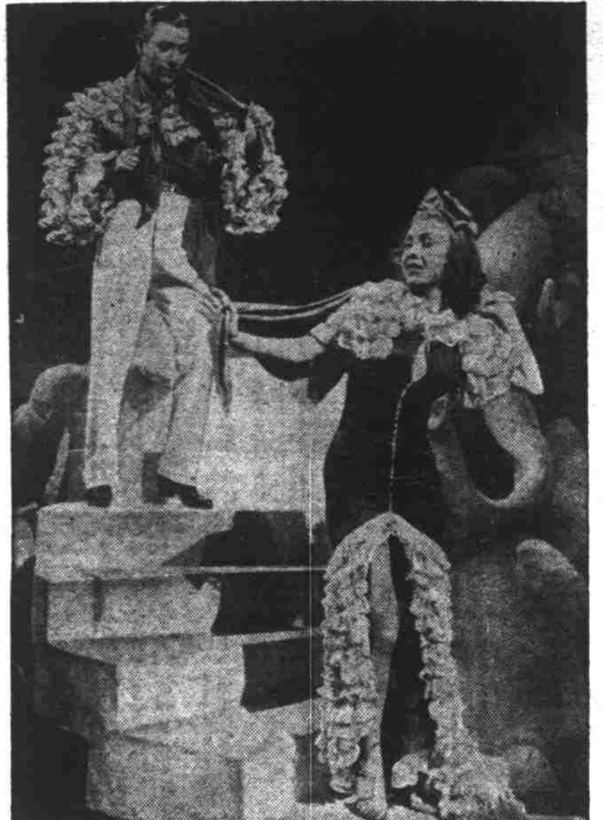
George Raft and Margo execute some intricate dances in "Rumba" at the State today.