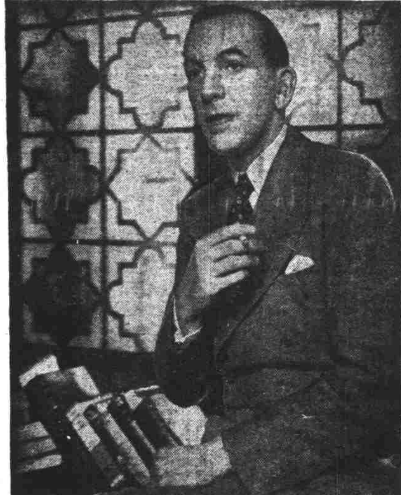
"The Scoundrel", produced by Charles MacArthur and Ben Hecht, features Noel Coward, the famous playwright and actor. Now showing at the Capitol.