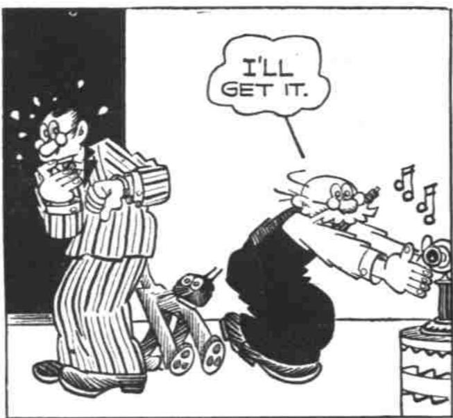
The Ghost Talks