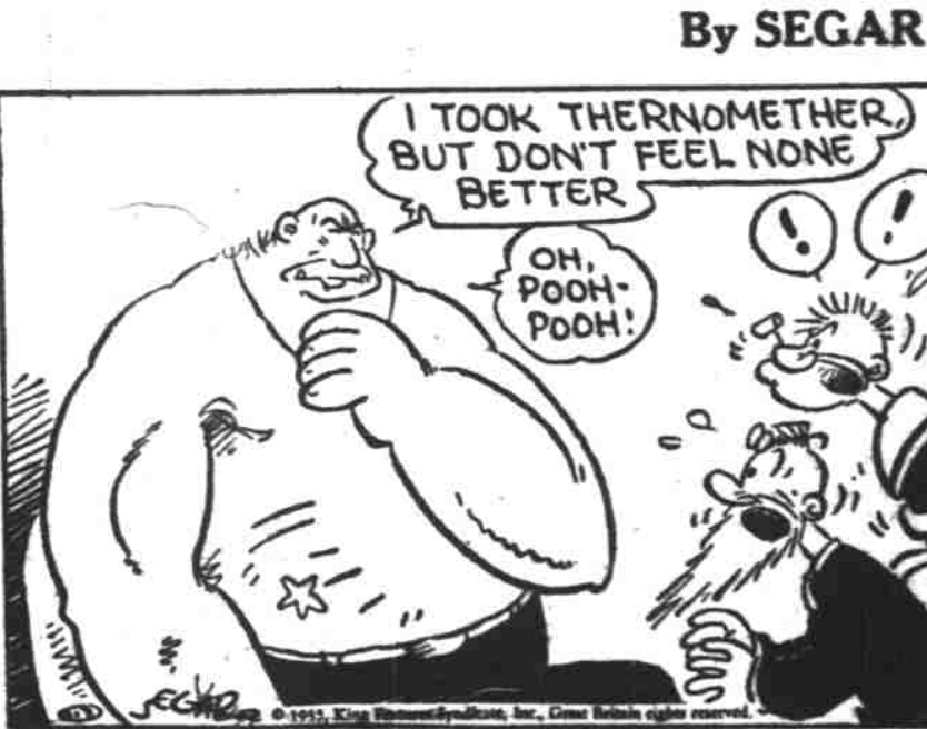
THINK YA KIN PULL HIM THROUGH, DOC ?