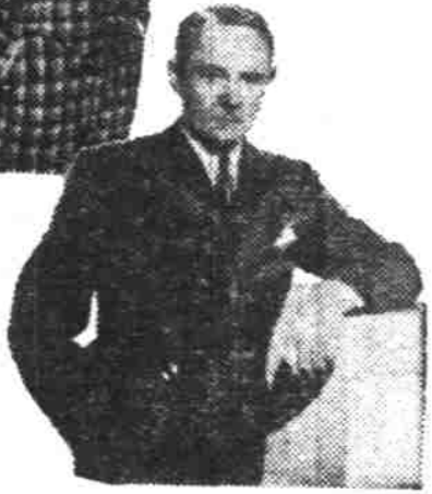
Charlie Ruggles, as he looks normally in a smart but conservative double-breasted serge suit.

LOOK what they do to Charlie Ruggles, for example. Dressed up in his "Ruggles of Red Gap" duds, he's a sight to frighten little children . . . but back in a well-tailored business suit, he's once more a recognizable human being.