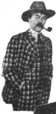
Charlie Ruggles, as he appears in "Ruggles of Red Gap."