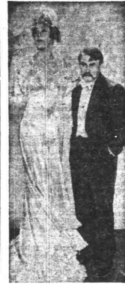
Mary Boland and Charlie Ruggles, above, are a famous screen couple. They appear in "Ruggles of Red Gap" at the Elsinore, starting today. The spring fashion revue tomorrow night will supplement the feature picture.