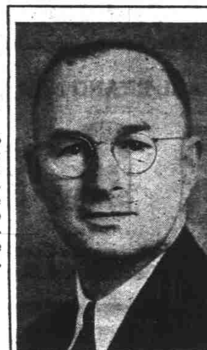
C. S. Orwig