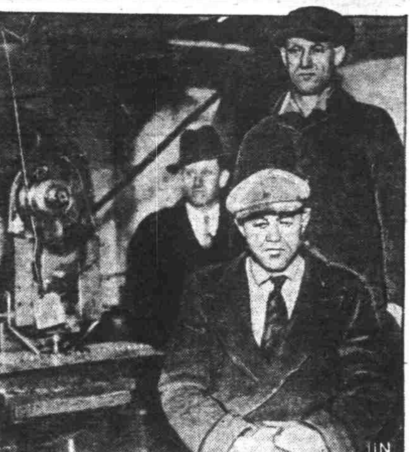
The bogus nickel mill and three prisoners seized by secret service agents in a raid on an abandoned farmhouse near Goshen, N. Y.