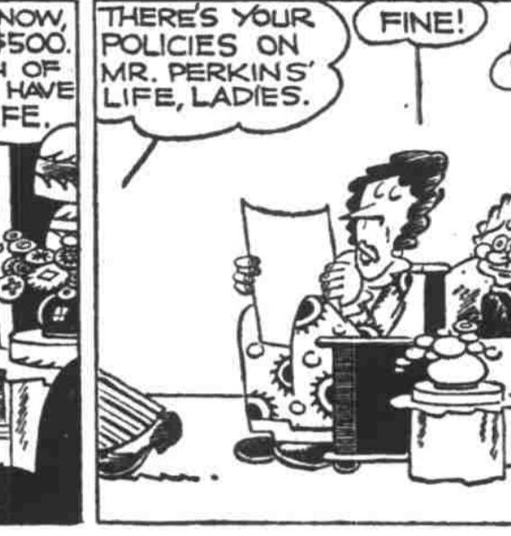
Left Holding the Rag