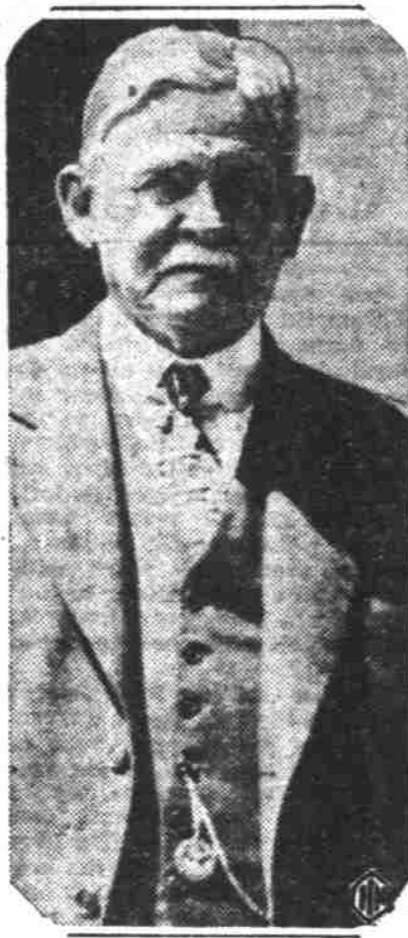
Dr. John "Jafie" Condon

Dr. John "Jafie" Condon, of Lindbergh ransom fame, was found living in seclusion in a hotel at Balboa, in the Canal Zone, where he maintained a "body-guard" and vacationed incognito. "I'm muzzled," he asserted, and refused to discuss events of the Hauptmann trial.