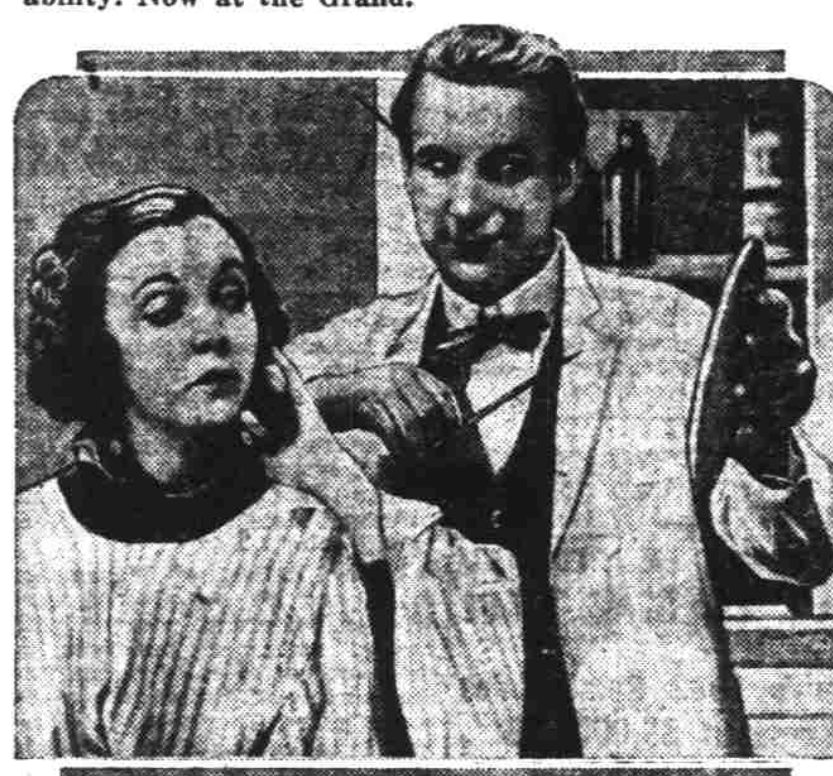
ZaSu Pitts gazes hopefully into the mirror held by El Brendel, one-chair barber, in "The Meanest Gal in Town,"

tion was only half of normal, con- cated that there were several ditions in Oregon were favorable fires, but none of them was seri-