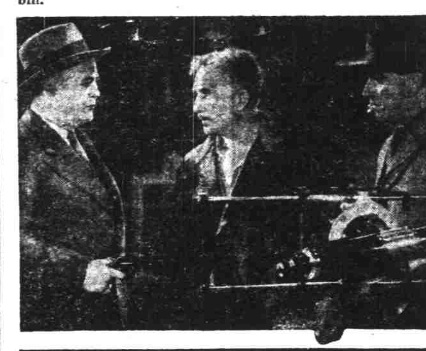
Return of the Terror" at the Capitol on a double bill, provides plenty of thrills as well as a fascinating plot.