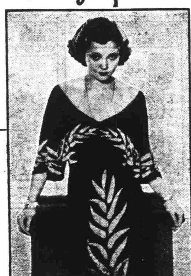
See Sylvia Sidney in her new Paramount starring picture "Thirty Day Princess" ... at your local theatre soon