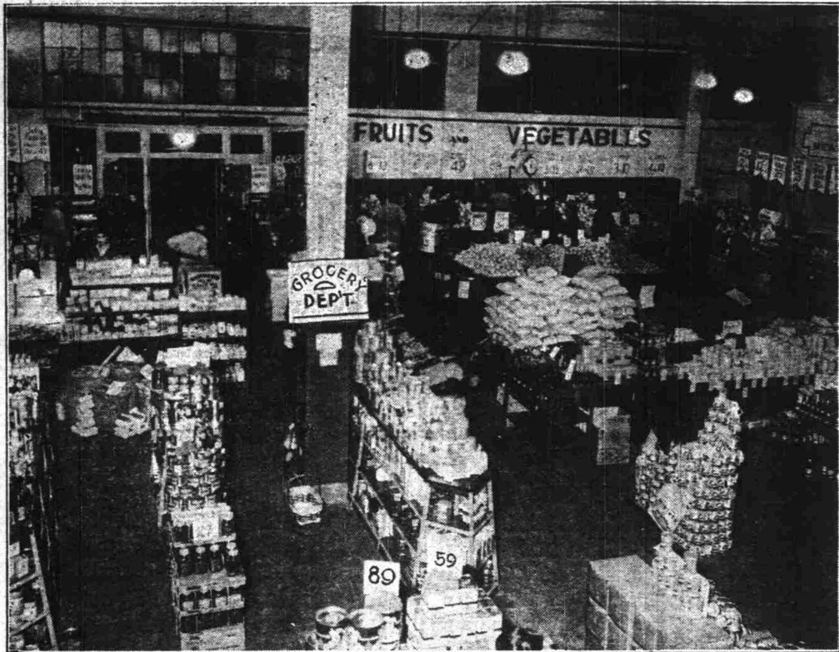
Pictures above shows portion of the interior of Busick's Market grocery. Merchandise is attractively displayed and made easily accessible to trade on latest design in steel furniture for a grocery. In addition to groceries, Busick's Market store has a full vegetable, meat and bakery department.

NEWLY ARRANGED STORE GREET'S SALEM BUYERS