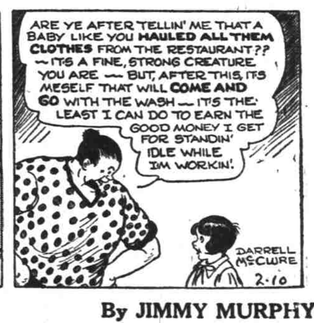
Another Dashed Hope