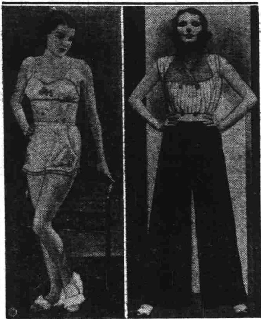
Two of the newest innovations smiled upon by Dame Fashion. At left, the new lingerie outfit of softest milanese chiffon of chardonnais, designed to go with the close-fitting evening frock and to eliminate unsightly seams. At right, the latest thing in pajama ensembles, composed of slacks and crocheted double-breasted veste.