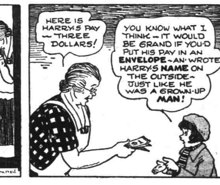
Bringing Home the Bacon