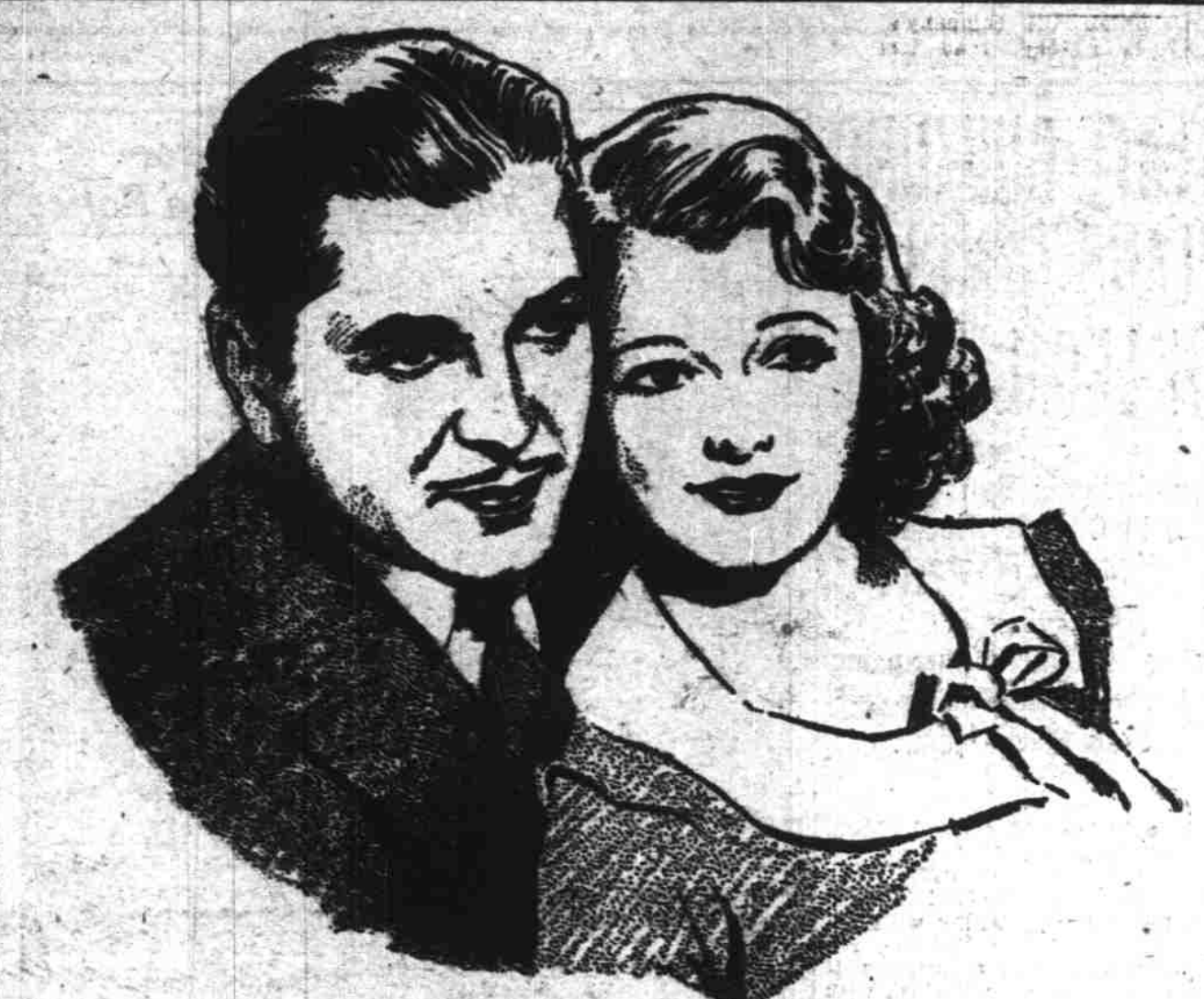
Warner Baxter and Janet Gaynor return to Salem in "Paddy," a lively Irish romance, at the Hollywood this week.