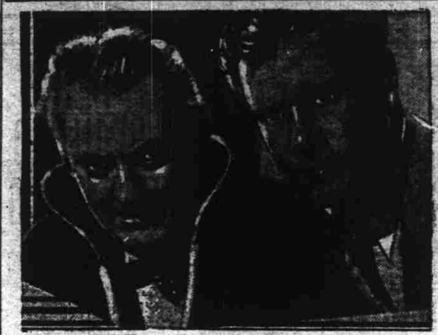
Lionel Barrymore as the country doctor and Joel McCrea as his son have vivid roles in "One Man's Journey" at the Grand.