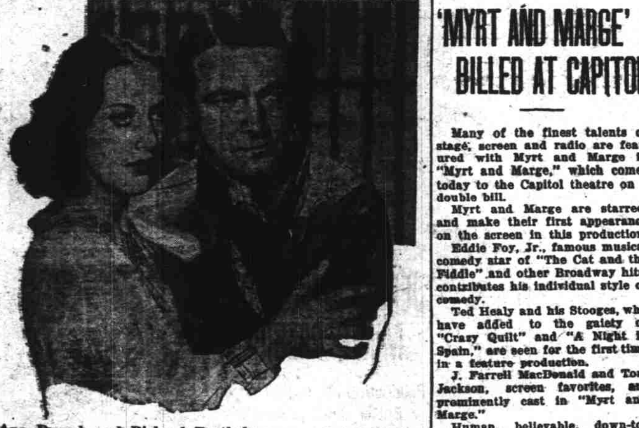
Ann Dvorak and Richard Barthelmess are cast as Indian lovers in "Massacre," current feature at the Elsinore.