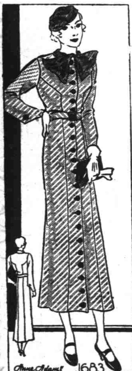
By ANNE ADAMS

Here's a frock that is smart under a coat, but smarter yet for street wear later in the season when weather permits. You can tell at a glance it was Paris-inspired—the center-front button closing and chic scarf are ingenious details. Note, too, how the paneled seamings help create the coveted slim silhouette. The new sheer wools, heavy crepes, or novelty weave cottons would make up smartly with the scarf of contrasting ribbed silk or satin. Achieving that tailored look is easy, if you follow the instructor given with the pattern.