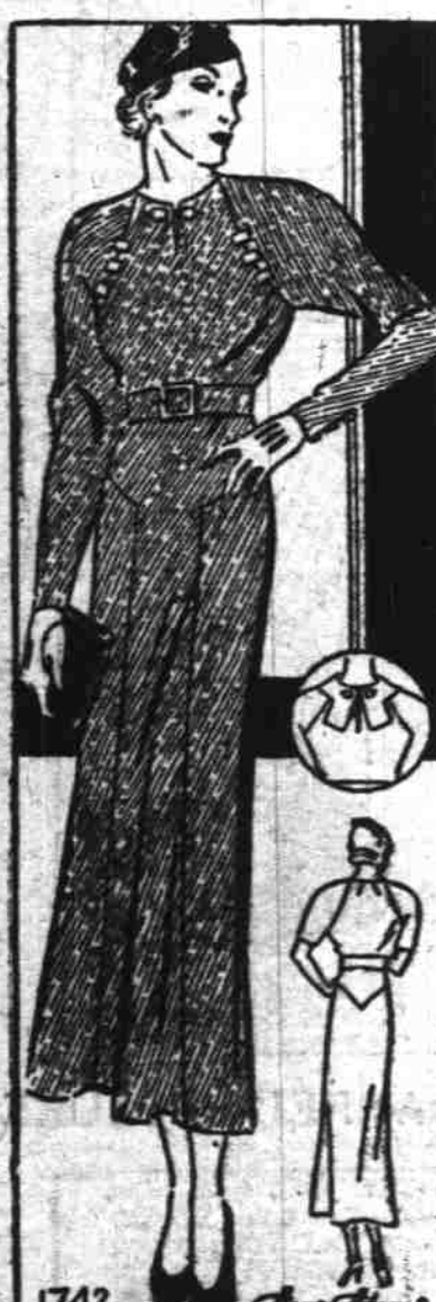
By ANNE ADAMS

Everything unusual about the new frocks centers on the neckline! The interest may be part of the frock itself, or may be achieved by a fetching little collar. This trim model adopts both—and we think it the smartest thing we've seen in ages! The large figure shows a close-to-the-throat closing, accented by snappy buttons—with lower armhole and raglan seaming. Lovely in a new crepe, tulle or sheer wool. Pattern 1742 is available in sizes 12, 14, 16, 18, 20, 22, 24, 26, 28 and 40. Size 14 takes 2 1/2 yards 54 inch fabric and 3/4 yard 36 inch contrasting. Illustrated step-by-step sewing instructions included.