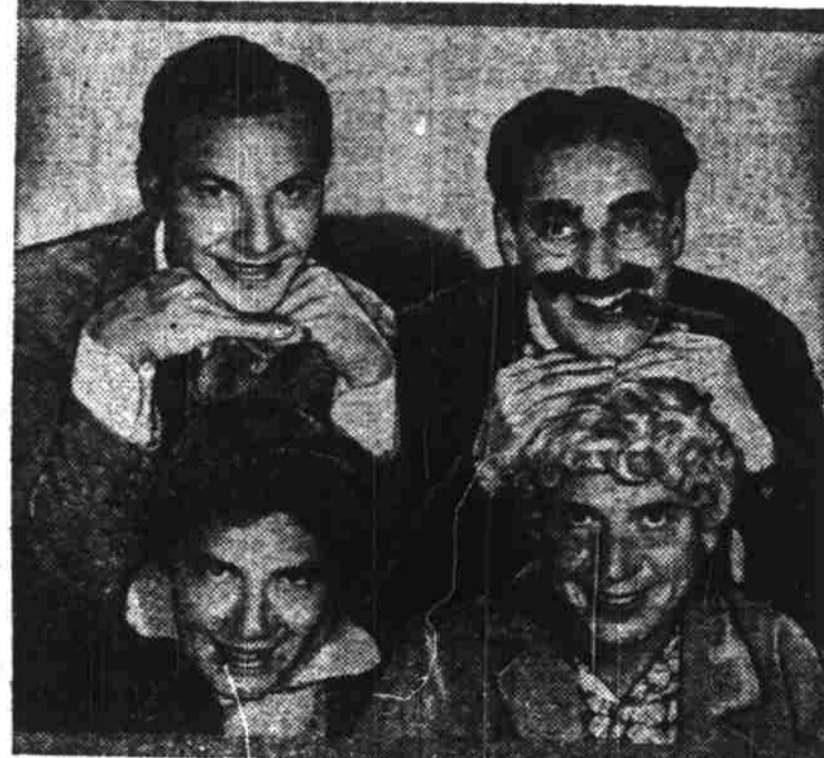
The Four Mad Marx Brothers in their latest riot, "Duck Soup" at the Elsinore.