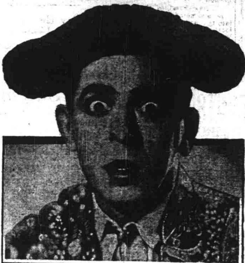
Eddie Cantor turns cavalier and bull-fighter in "The Kid From Spain" at the State.