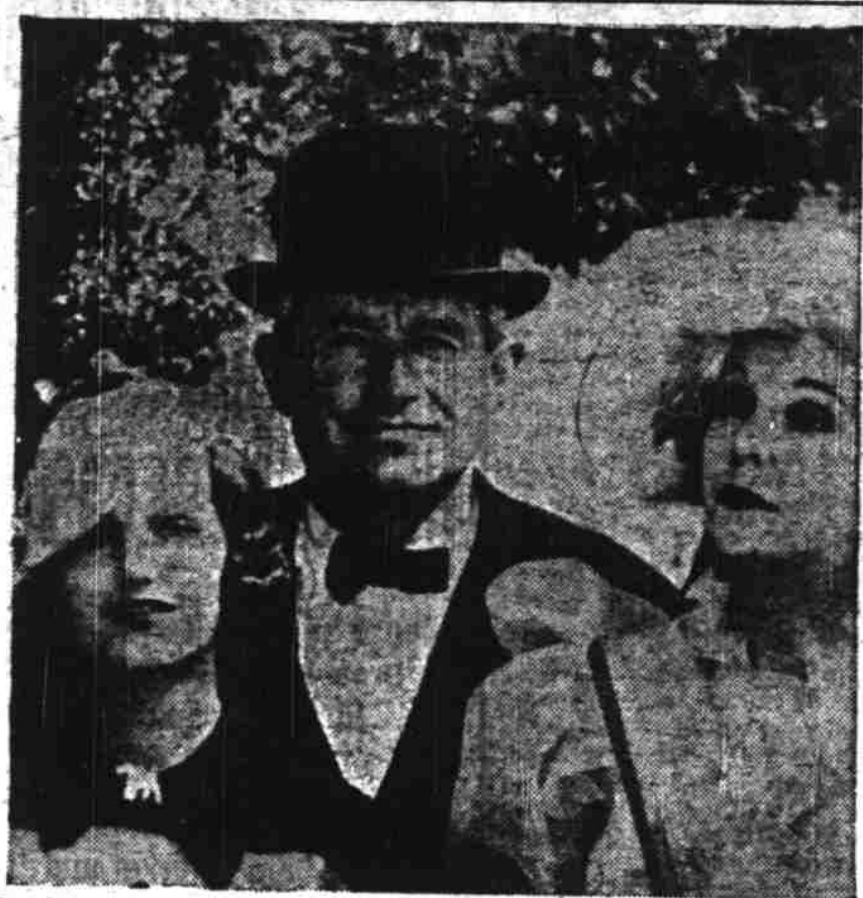
Rochelle Hudson, Will Rogers and ZaSu Pitts have leading roles in "Mr. Skitch" now at the Grand for the entire week.