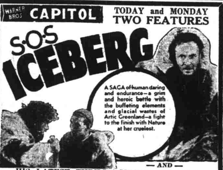
HIS LATEST THRILL-A-MINUTE WESTERN