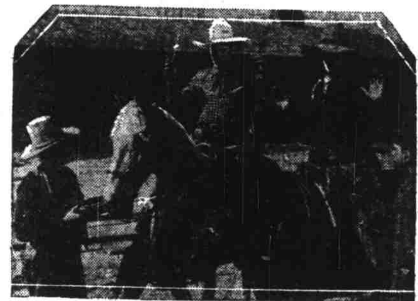
Scene from the "Fiddlin' Buckaroo" with Ken Maynard playing at the Capitol on a double bill with "S.O.S. Iceberg."