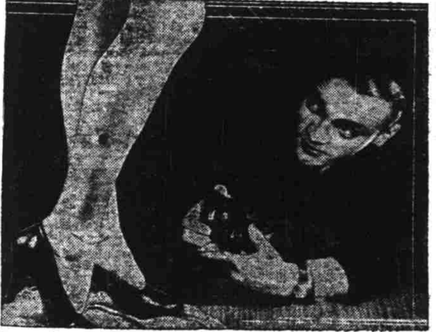
Jimmy Cagney snatches photos anywhere for his tabloid in his current picture at the Hollywood, "Picture Snatcher," on a double bill with George O'Brien in "The Last Trail."