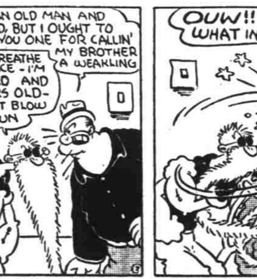
By DARREL McCLURE