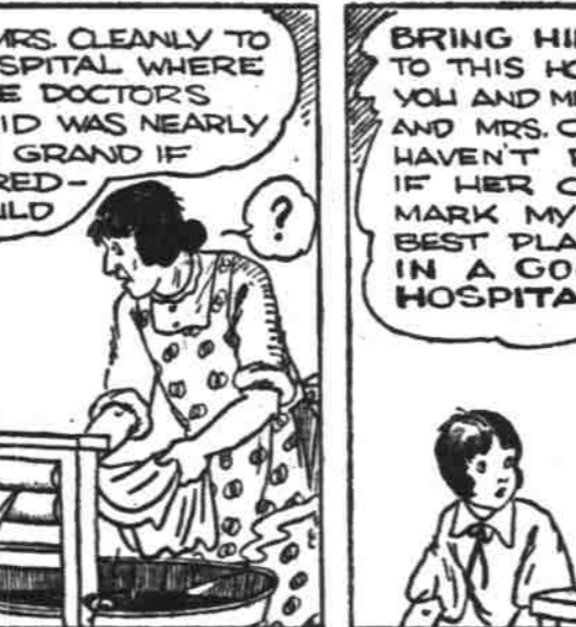
Buttercup "Horns In"