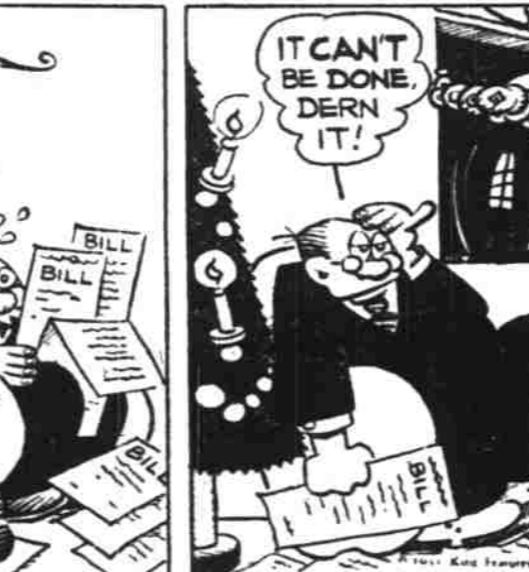
Boys Will Be Boys