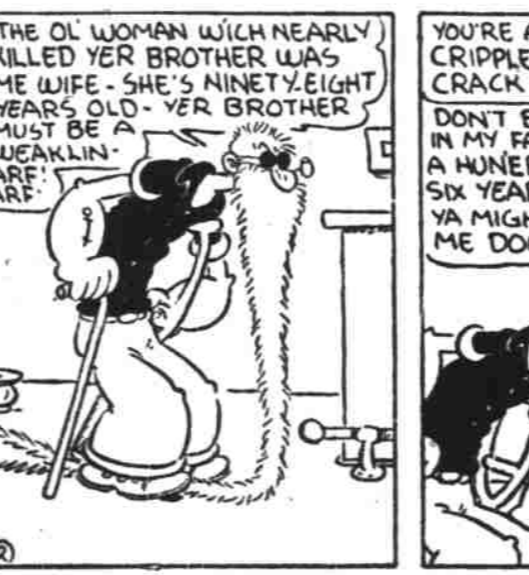
Beggar on Horseback