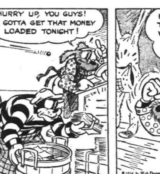
Now Showing—"Respect for the Aged"