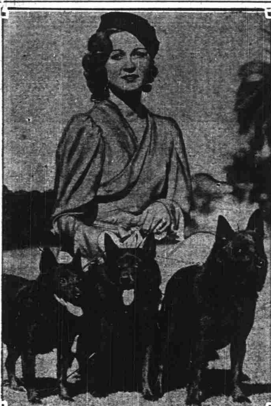
In Belgium and Holland these Schipperkes, or "little skippers" are watchdogs on canal boats. But in Los Angeles they are prize pets entered in the national winter dog show.