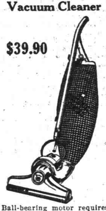
Ball-bearing motor requires no oiling. Motor driven brush insures efficient