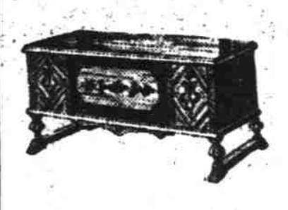
Lane Cedar Chests

Other occasional chairs as low. as $5.95