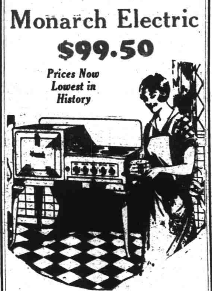
Latest model, full porcelain and chromium finish, four surface elements, automatic oven porcelain lined. Choice of color. In addition to this extra low price your home will be wired for the range for only $10.00. This offer terminates December 24th.