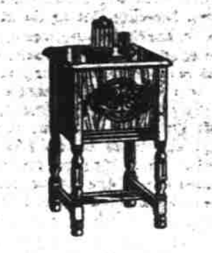
Very sturdy, with attractive Humidor Smokers of green or $12.75 $4.95 to $11.75