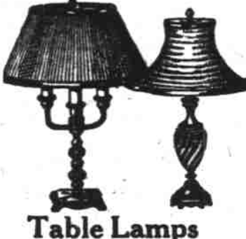
Beautiful patterns as low as $1.95