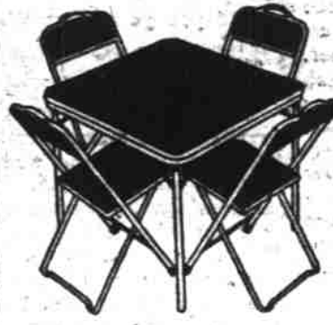
Metal Bridge Sets waterproof covering. Choice Plain and copper lined -