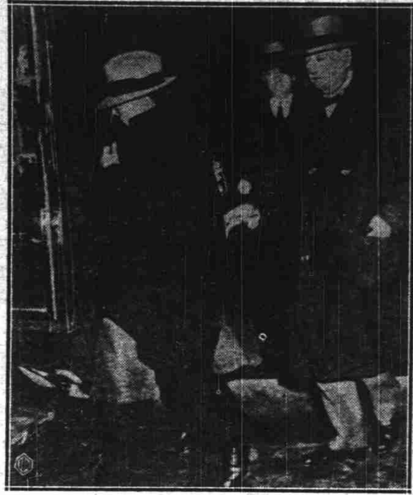
Convicted of income tax evasion and sentenced to 10 years in prison and a fine of $80,000, Irving Wexler, better known as Waxey Gordon, erstwhile beer baron, is shown outside New York Federal Court as he climbed aboard the "Black Maria" for a free ride to the House of Detention pending a decision on which Federal prison is to be his future home.