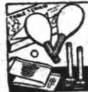
Table Tennis, Double Set — Only ... 50c

Wooden Chest Gilbert Tools, 13 pcs., $1.00