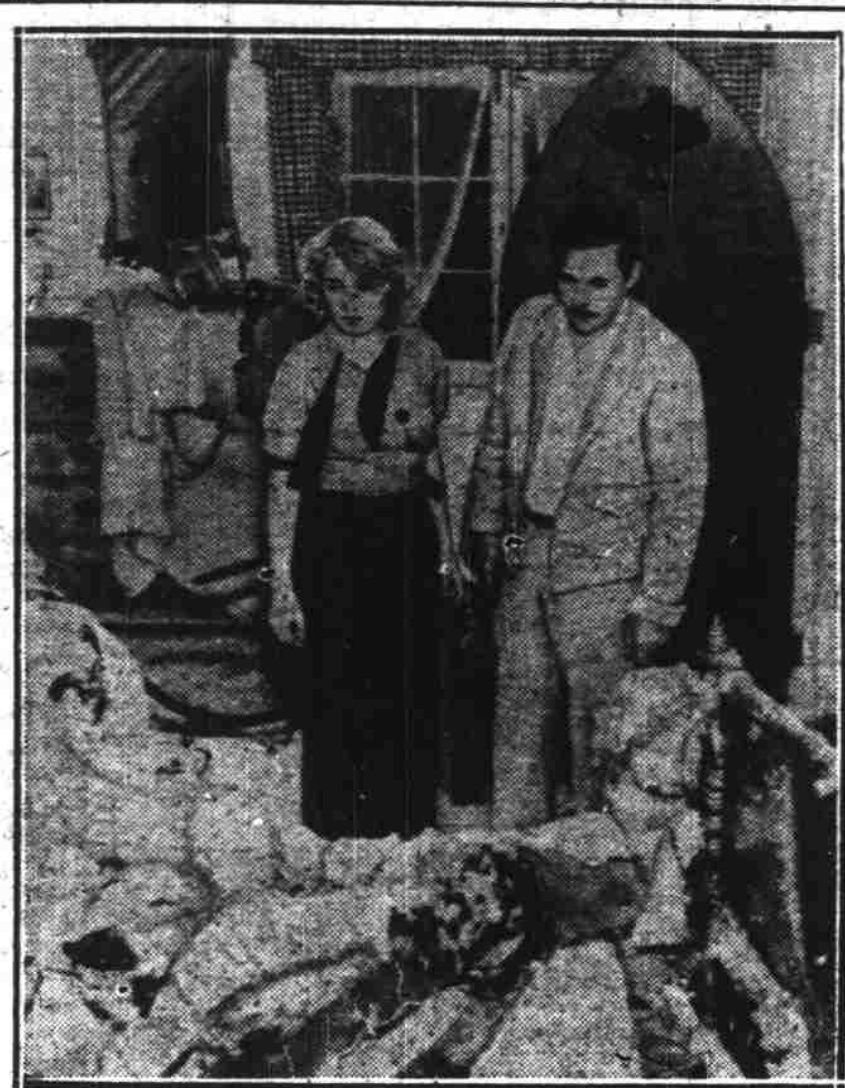
A thrill without benefit of director, cameras or klieg lights was experienced by Joan Blondell, screen star, and her cameraman husband, George Barnes, when a fire started in a bedroom of their Hollywood home while they were at dinner. Here they are surveying the damage when the blaze had been extinguished.