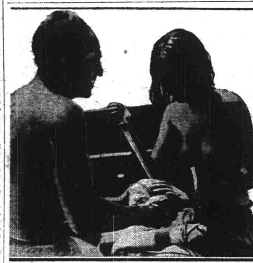
The two native lovers of the South Sea film, "Samarang showing at the State. This is its first run in Salem.