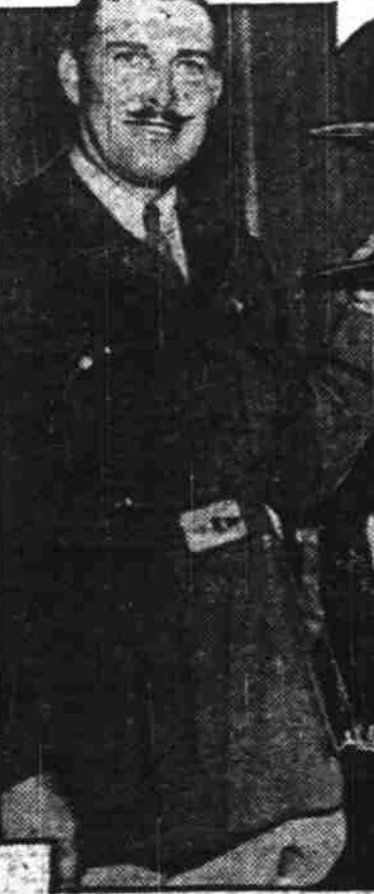
Colonel Roscoe Turner, one of America's foremost fliers and holder of the trans-continental speed record, pictured at New York with the Harmon Trophy awarded him because of his outstanding achievements for aviation in 1932. Presentation was made by F. Trubee Davison, Assistant Secretary of War for Aviation.