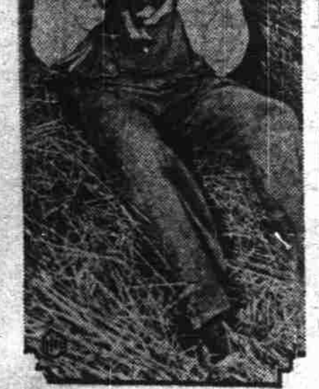
"Who's afraid of the big, bad Gooses?" is the way these two little, one-day-old pigs might sing the popular refrain. For their name is Goose Goslin, of the Washington Senators, who is back on his farm in Salem, N. J., after the Winter Series. He'll spend the Winter farming and duck-hunting.