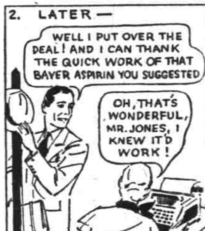
Real BAYER Aspirin "Takes Hold" of Pain in Few Minutes

Now comes amazingly quick relief from headaches, rheumatism, neuritis, neuralgia . . . the fastest safe relief, it is said, yet discovered.