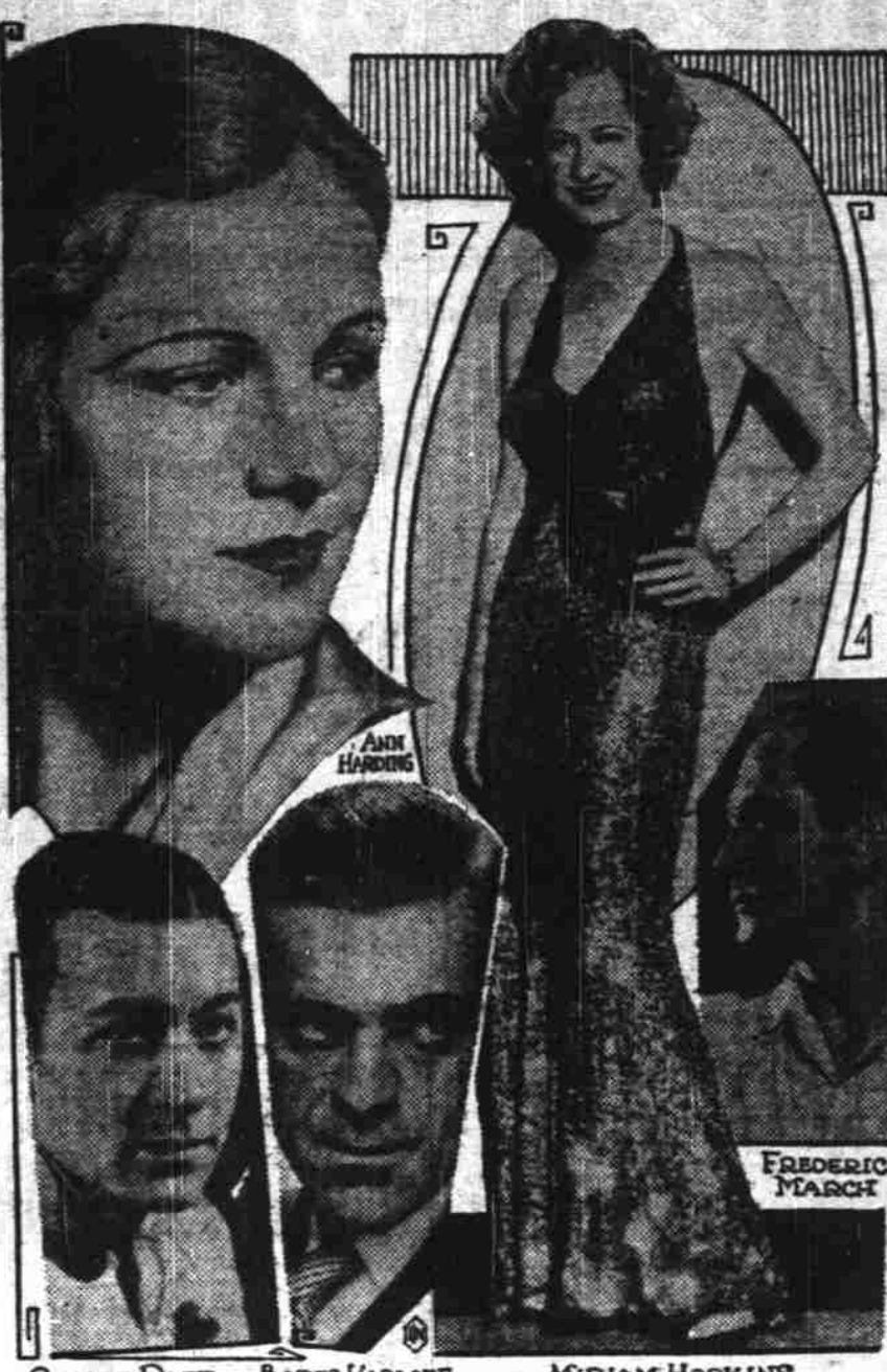
GEORGE RAFT BORIS KARLOFF MIRIAM HOPKINS ANN HARDING FREDERIC MARCH

Here are a few of the prominent Hollywood stars who have registered a protest against the NRA code proposed by the motion picture industry. Fourteen leading performers resigned membership in the Academy of Motion Picture Arts and Sciences and sent a protest to Washington against the formation of a "salary control board."