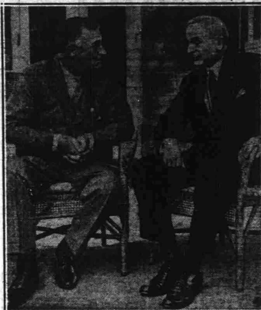
At this informal conference on the porch of the Summer White House at Hyde Park, N. Y., Secretary of State Cordell Hull, just back from London, made a comprehensive report of the recent World Economic Conference to President Roosevelt. Incidentally, the harmonious meeting disposed of rumors that the Secretary of State would resign.